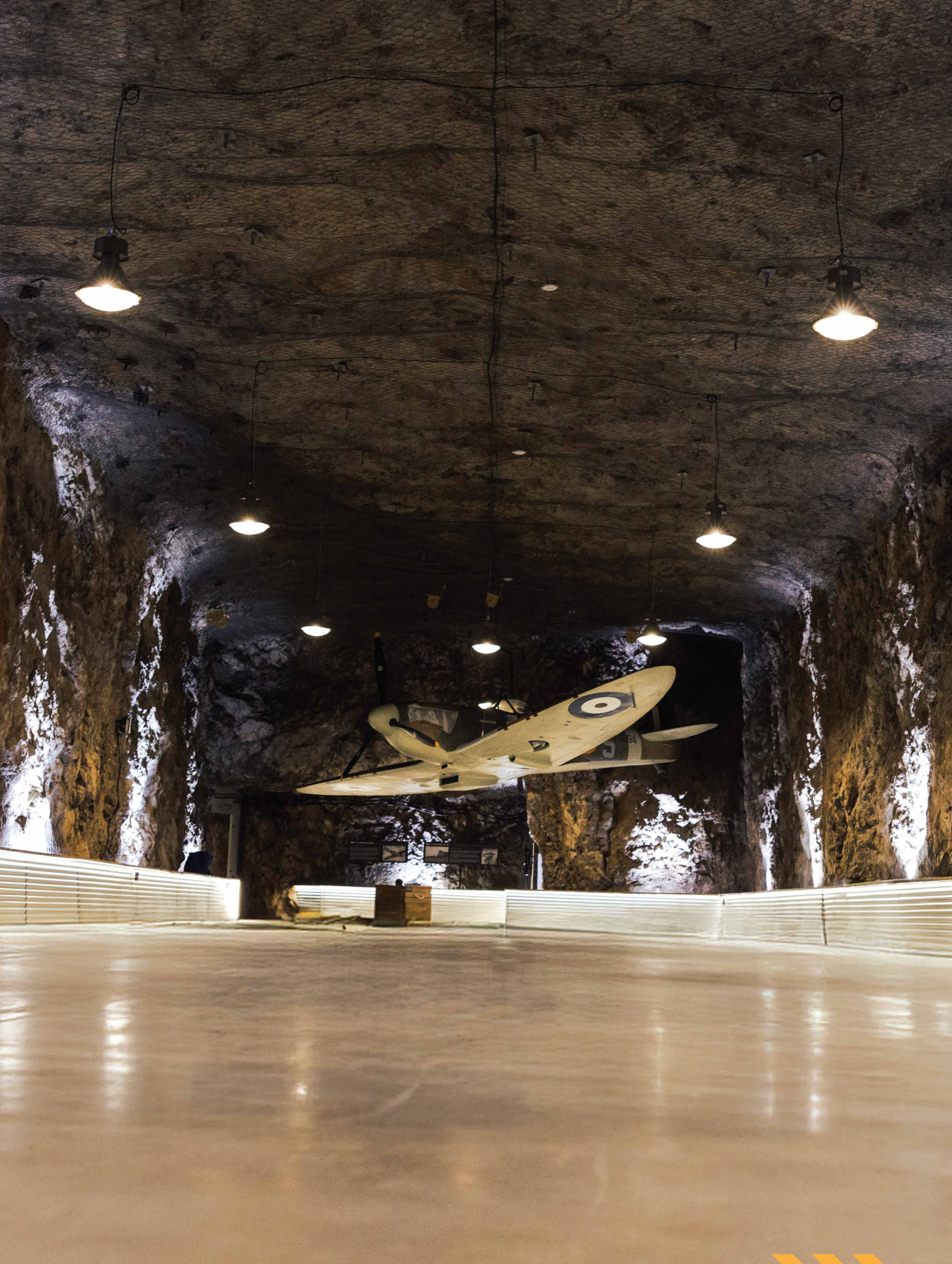
THE SPITFIRE HALL