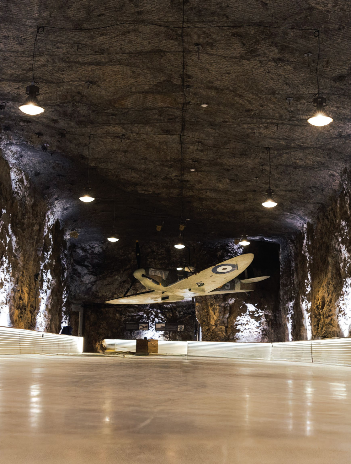
THE SPITFIRE HALL